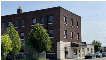
PACE Thunder Bay, 409 George Street