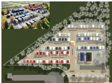
City of Thunder Bay shelter village design renderings