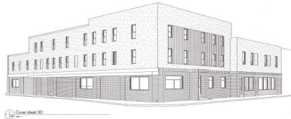
Urban Abbey 227 Simpson Street project floor plans