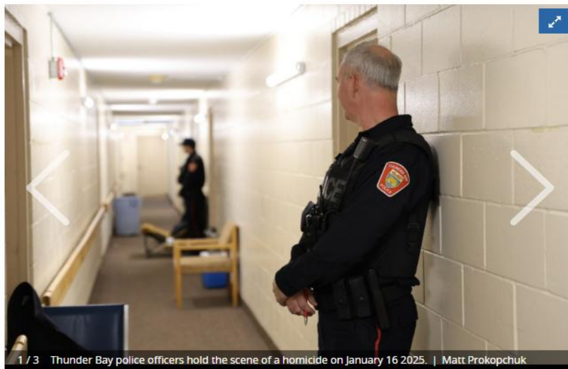
1 / 3 Thunder Bay police officers hold the scene of a homicide on January 16 2025. | Matt Prokopchuk

Image three - Obtained from https://www.tbnewswatch.com/local-news/terrified-mcivor-court-residents-react-to-homicide-10088244