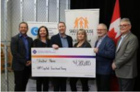
Representatives from TBDSSAB and Shelter House (funding recipient) and NorWest CHC (health partner)