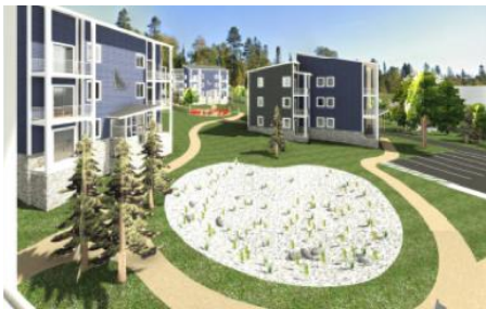
OAHS Huron Avenue project rendering, Image 1 of 2