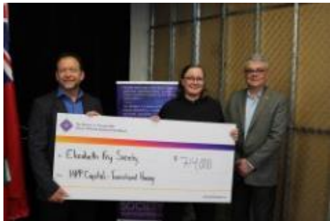
Representatives from TBDSSAB and Elizabeth Fry Society of Northwestern Ontario