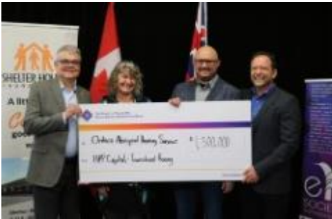
Representatives from TBDSSAB and Ontario Aboriginal Housing Services