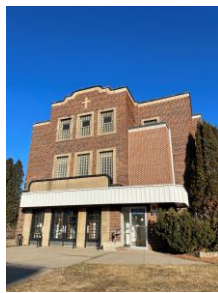
Northern Linkage and SJCG project – Brock Street exterior (fall 2023)