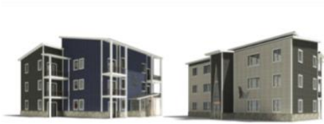
OAHs Huron Avenue project rendering, Image 2 of 2