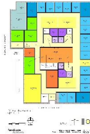
Shelter House and NorWest CHC project floorplan