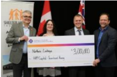
Representatives from TBDSSAB and Northern Linkage (funding recipient) and St. Joseph's Care Group (health partner)